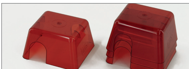
Mouse cottage, red