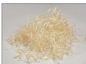
Aspen wood wool