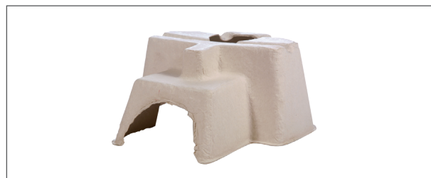
Rat Corner Home