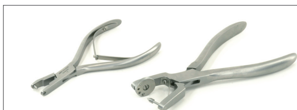
Hole punch for ear marks